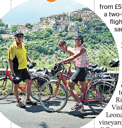
Cycling from Pisa to Florence