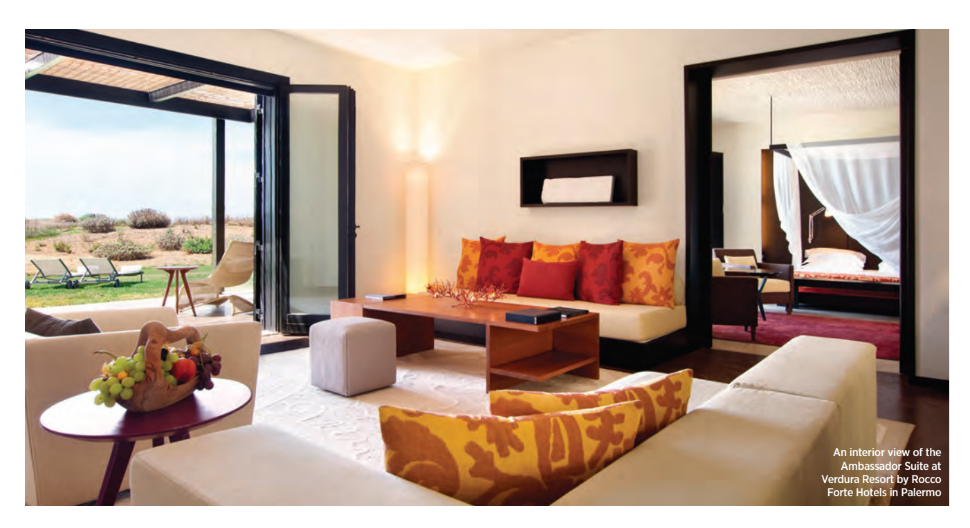
135 HarpersBazaarArabia.com/Interiors Autumn 2018

Each space incorporates contemporary design into a relaxed setting, one that melds with the local scenery and resort vibe. Polizzi travelled throughout Sicily looking for materials. She found that handcrafted tiles were a key traditional feature of houses and villas in Sicily and so they became a cornerstone of the design for Verdura. She enlisted Sicilian company Caltagirone to handcraft the tiles used throughout the resort and accompanied them with soft throws, lampshades and cushions in the bedroom. Polizzi then used Sicilian colours - ochre, violet, and scarlet - to accentuate the space against a white background. I loved the modern four-poster bed made in dark wood with simple romantic white muslin curtains. Once again, the sight whisked me away to the exotic Orient. Soft lighting is provided by lamps with fabric cylinders and made by Italian lighting company, Flos. Verdura's a Sicilian dream. One taste and you'll be hooked to its alluring character and culture that sits between Italy and the Orient. roccofortehotels.com